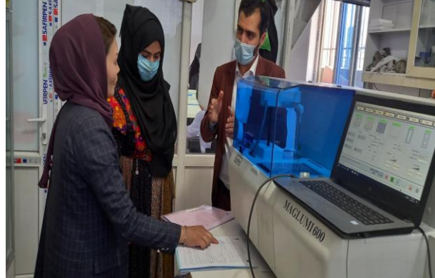
Figure 1 ToT on job training, Parwan