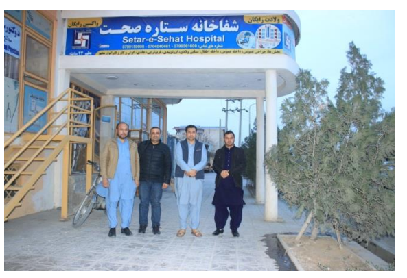
Figure 1 ToT training EZ-KAR Baghlan

We trained 217 private stockholders (medical private doctors, pharmacists, lab technicians, G specialists, lab technicians, radiologists...etc.) in 3 batches to detect early TB patients according to project objectives.